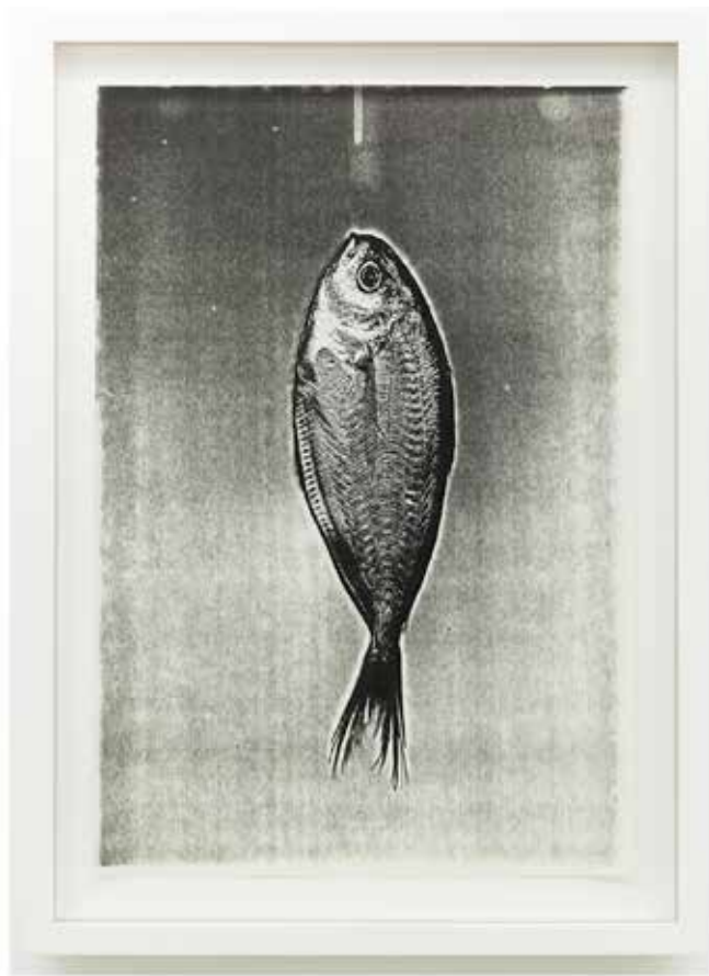
Pati Hill, Unfried (fish) , 1977–79, black and white photocopy, 28 x 21 cm.

Hill was best known in her lifetime as a writer, and the show's press release centres that practice, detailing her efforts to give 'even footing side by side' to language and image. At the entrance to the gallery, her poetry, fiction and manifesto sit alongside a vase of roses, which mirror the copied rose in the main gallery space, hovering in a black background a few inches above a cat comb. In her collection Slave Days (1975), Hill's photocopies combine with poetry to consider domestic labour and confinement: